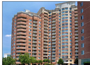
Aura Pentagon City

City: Arlington, Va. Buyer: Polinger Co. Purchase Price: $228 MM Price per Unit: $426,966