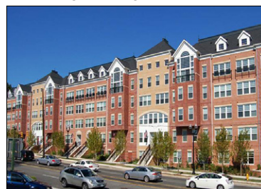
Bell Arlington Ridge

City: Arlington, Va. Buyer: Bell Partners Purchase Price: $75 MM Price per Unit: $344,378