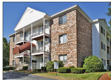
Halls at Manchester

City: Manchester, N.H. Buyer: DSF Group Purchase Price: $89 MM Price per Unit: $138,281