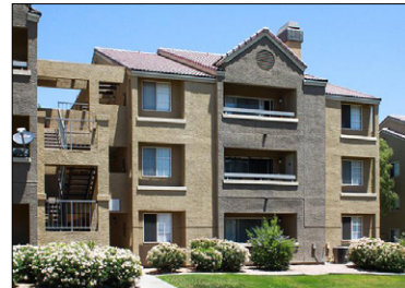
Array South Mountain

City: Phoenix Buyer: Bridge Investment Group Purchase Price: $99 MM Price per Unit: $164,958