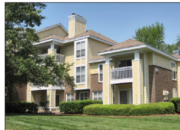
The Retreat at McAlpine Creek

City: Charlotte, N.C. Buyer: Waterton Purchase Price: $60 MM Price per Unit: $151,149