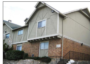
Bridge at Terracina

City: Austin, Texas Buyer: Housing Authority of Austin Purchase Price: $20 MM Price per Unit: $117,671