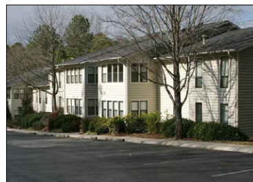
Rosemont Vinings Ridge

City: Atlanta Buyer: Buckingham Cos. Purchase Price: $88 MM Price per Unit: $178,644