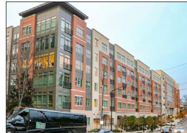
Hanover East Paces

City: Atlanta Buyer: Utah Property Management Associates Purchase Price: $117 MM Price per Unit: $312,267