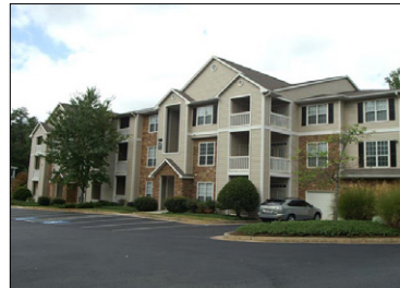
Avery at Northwinds

City: Alpharetta, Ga. Buyer: Pollack Shores Purchase Price: $172 MM Price per Unit: $215,469