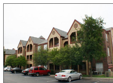
Preserve Wells Branch

City: Austin, Texas Buyer: Housing Authority of Austin Purchase Price: $32 MM Price per Unit: $102,727