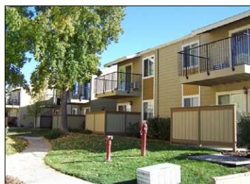
IMT Pleasant Hill

City: Pleasant Hill, Calif. Buyer: IMT Capital Purchase Price: $91 MM Price per Unit: $361,111