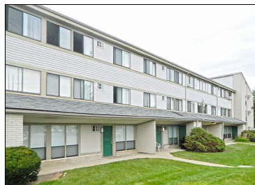
Village Green of Waterford

City: Waterford, Mich. Buyer: RESSCO Purchase Price: $31 MM Price per Unit: $77,695