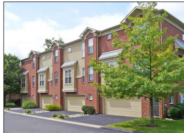
Fairlane Town Center

City: Dearborn, Mich. Buyer: Forum Real Estate Group Purchase Price: $41 MM Price per Unit: $206,400