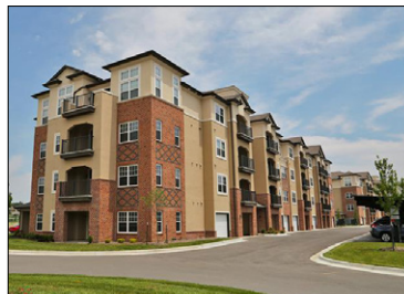
The Landing at Briarcliff

City: Kansas City Buyer: JVM Realty Purchase Price: $55 MM Price per Unit: $160,784