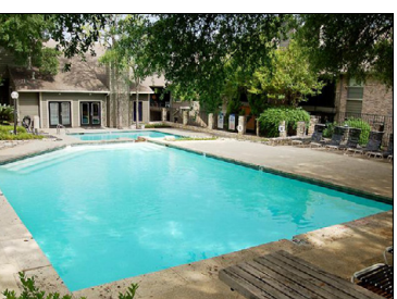
Mission Grace Woods

City: Austin, Texas Buyer: InterCapital Partners Purchase Price: $47 MM Price per Unit: $108,527