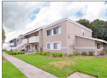
Surf at 39

City: Huntington Beach, Calif. Buyer: Interstate Equities Corp. Purchase Price: $134 MM Price per Unit: $335,000