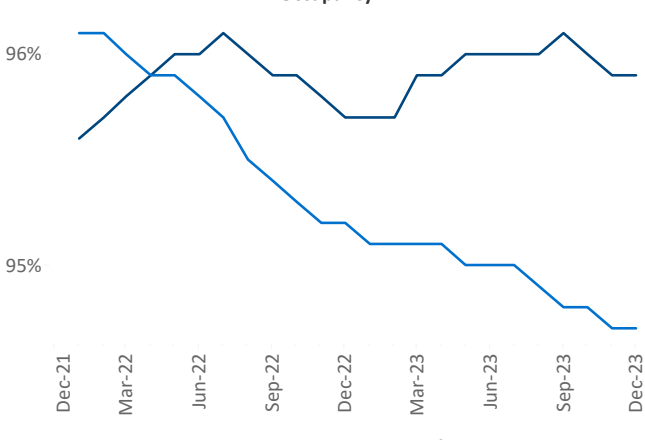
Units Under Construction as % of Stock