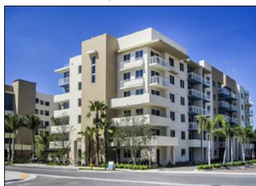
The Manor CityPlace Doral

City: Doral, Fla. Buyer: TA Associates Realty Purchase Price: $135 MM Price per Unit: $339,196