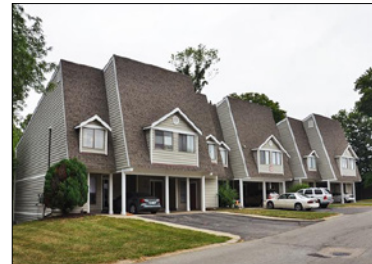
The Cottages of Fall Creek

City: Indianapolis Buyer: Pepper Pike Capital Partners Purchase Price: $57 MM Price per Unit: $75,184