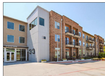
Pure Farmers Market

City: Dallas Buyer: Pure Multi Purchase Price: $66 MM Price per Unit: $195,147