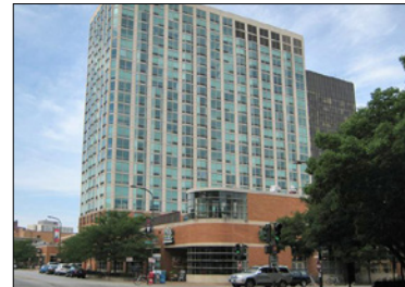
The Park Evanston

City: Evanston, Ill. Buyer: New York Life Investors Purchase Price: $127 MM Price per Unit: $448,763