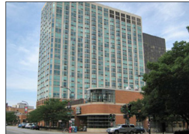
The Park Evanston

City: Evanston, Ill. Buyer: New York Life Investors Purchase Price: $127 MM Price per Unit: $448,763