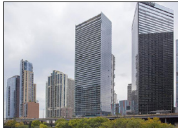
Coast at Lakeshore East

City: Chicago Buyer: Morguard Residential Purchase Price: $223 MM Price per Unit: $432,039