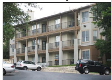
State House on Congress

City: Austin, Texas Buyer: Turnbridge Equities Purchase Price: $121 MM Price per Unit: $421,324