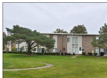
The Crossings at Canton

City: Canton, Mich. Buyer: APM Management Purchase Price: $52 MM Price per Unit: $70,329