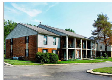
Sutton Place Apartments

City: Southfield, Mich. Buyer: GoldOller Real Estate Purchase Price: $59 MM Price per Unit: $113,809