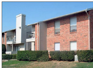
Woods of Bedford

City: Bedford, Texas Buyer: Starwood Capital Group Purchase Price: $85 MM Price per Unit: $120,000