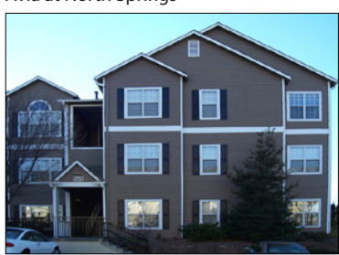
Avia at North Springs

City: Atlanta Buyer: Harbor Group International Purchase Price: $93 MM Price per Unit: $176,121