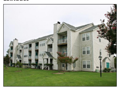
City: Virginia Beach, Va. Buyer: Chandler Management Purchase Price: $56 MM Price per Unit: $124,732