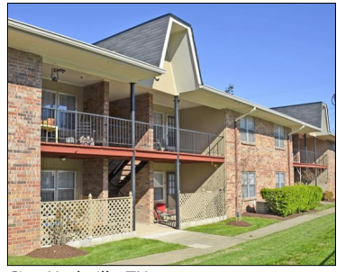
City: Nashville, TN Buyer: BH Properties Purchase Price: $4 MM Price per Unit: $54,688