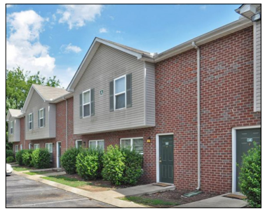
City: Murfreesboro, TN Buyer: Dominium Purchase Price: $11MM Price per Unit: $61,413