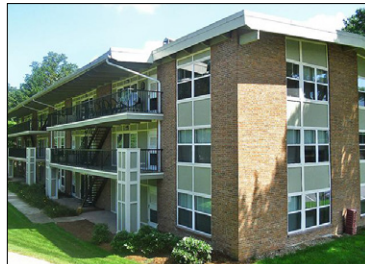
The Commons at Windsor Gardens

City: Norwood, Mass. Buyer: AllianceBernstein Purchase Price: $199 MM Price per Unit: $217,724