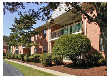
Highland Glen I

City: Westwood, Mass. Buyer: Beacon Communities Purchase Price: $75 MM Price per Unit: $416,667