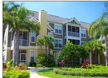
TGM Bay Isle

City: St. Petersburg, Fla. Buyer: TGM Associates Purchase Price: $94 MM Price per Unit: $167,112