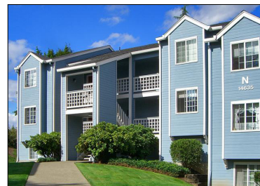
Seven West at the Trails

City: Beaverton, Ore. Buyer: LaSalle Investment Management Purchase Price: $96 MM Price per Unit: $226,950