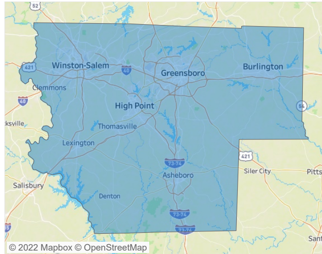
■ Triad ■ National