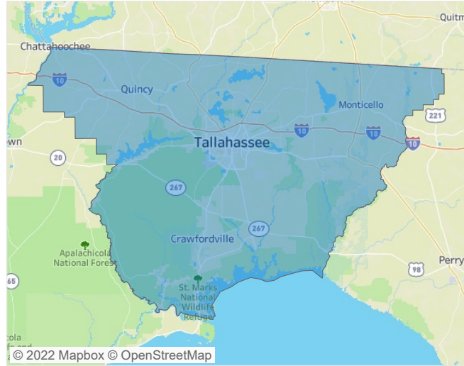
■ Tallahassee ■ National