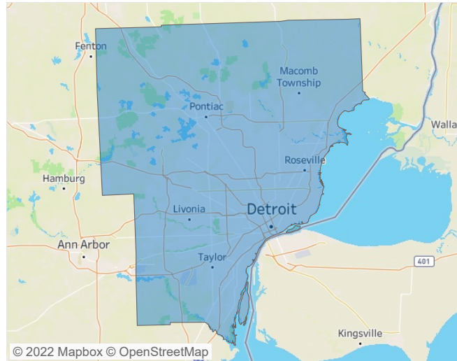
■ Detroit ■ National