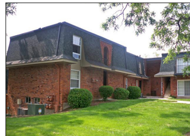
The Retreat at Seven Hills

City: Ballwin, Mo. Buyer: Monarch Investment & Mgmt. Purchase Price: $51 MM Price per Unit: $95,865