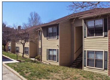
Sun Valley Lake

City: St. Charles, Mo. Buyer: Priderock Capital Partners Purchase Price: $55 MM Price per Unit: $81,020