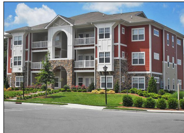
Cascades of Northlake

City: Charlotte, N.C. Buyer: Cortland Partners Purchase Price: $83 MM Price per Unit: $145,000