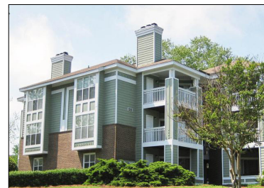
The Retreat at McAlpine Creek

City: Charlotte, N.C. Buyer: Bainbridge Cos. Purchase Price: $56 MM Price per Unit: $138,875