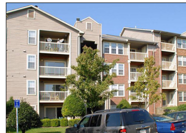
The Crossings at Washingtonian Center

City: Gaithersburg, Md. Buyer: Grosvenor Purchase Price: $146 MM Price per Unit: $225,308