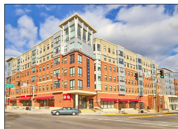
Landmark College Park

City: College Park, Md. Buyer: Principal Global Investors Purchase Price: $142MM Price per Unit: $531,835