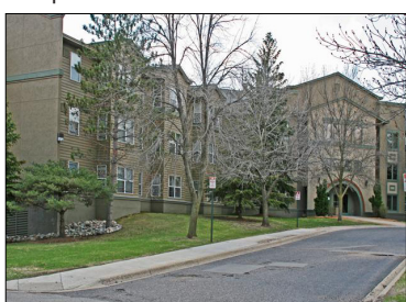
City: Bloomington, Minn. Buyer: Investcorp Purchase Price: $66 MM Price per Unit: $123,738