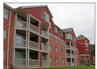
City: Eden Prairie, Minn. Buyer: New York Life Real Estate Investors Purchase Price: $80 MM Price per Unit: $162,857