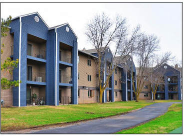
City: Plymouth, Minn. Buyer: LivCor Purchase Price: $78 MM Price per Unit: 155,314