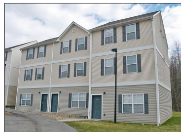
The Heights at Slippery Rock

City: Slippery Rock, Pa. Buyer: Ares Management Purchase Price: $13 MM Price per Unit: $126,000