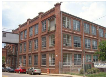
West Village I, II & III

City: Durham, N.C. Buyer: The Connor Group Purchase Price: $187 MM Price per Unit: $307,061