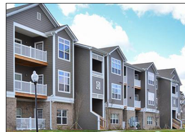
Ashton Reserve at Northlake

City: Charlotte, N.C. Buyer: Bluerock Real Estate Purchase Price: $67 MM Price per Unit: $140,739