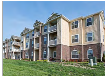
Copper Chase at Stones Crossing

City: Greenwood, Ind. Buyer: Legacy Real Estate Development Purchase Price: $40 MM Price per Unit: $133,446