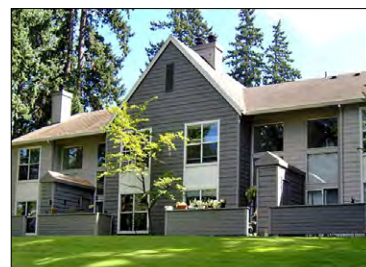
The Frank Estate

City: Portland, Ore. Buyer: Prime Group Purchase Price: $85 MM Price per Unit: $274,865