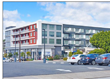
Hanover Mission Gorge

City: San Diego Buyer: R & V Management Purchase Price: $149 MM Price per Unit: $398,396