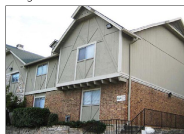
Bridge at Terracina

City: Austin, Texas Buyer: Housing Authority of Austin Purchase Price: $20 MM Price per Unit: $117,671