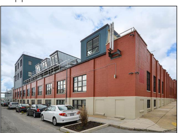
City: Richmond, Va. Buyer: Mercer Street Partners Purchase Price: $14 MM Price per Unit: $102,662