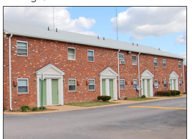
City: Richmond, Va. Buyer: Brick Lane Purchase Price: $25 MM Price per Unit: $71,225