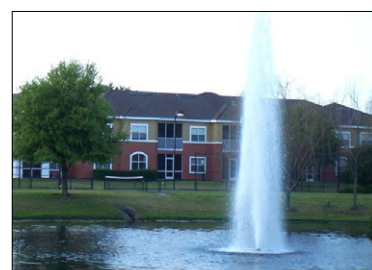
ARIUM Town Center

City: Jacksonville, Fla. Buyer: LivCor Purchase Price: $56 MM Price per Unit: $173,875