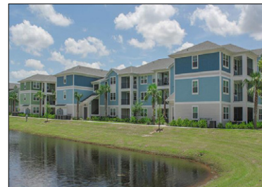
The Point at Tamaya

City: Jacksonville, Fla. Buyer: PASSCO Real Estate Purchase Price: $72 MM Price per Unit: $189,276