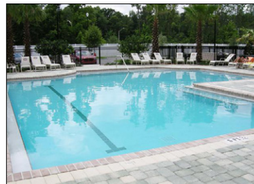
Century Deerwood Park

City: Jacksonville, Fla. Buyer: Centennial Holding Co. Purchase Price: $72 MM Price per Unit: $152,532