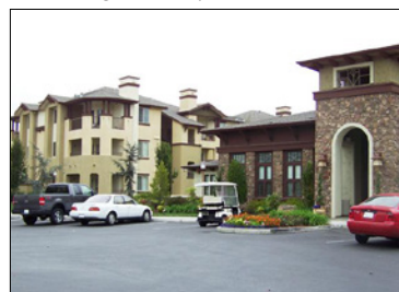
The Lodge at Napa Junction

City: American Canyon, Calif. Buyer: Taube Investments Purchase Price: $67 MM Price per Unit: $311,343