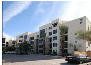
Ten01 on the Lake

City: Phoenix Buyer: PGIM Real Estate Purchase Price: $115 MM Price per Unit: $219,885