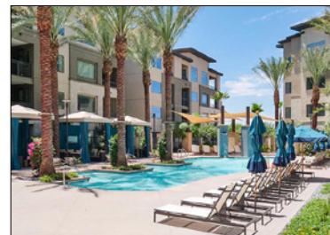
Broadstone Fashion Center

City: Phoenix Buyer: Starlight Investments Purchase Price: $84 MM Price per Unit: $250,746