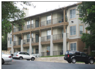
State House on Congress

City: Austin, Texas Buyer: Turnbridge Equities Purchase Price: $121 MM Price per Unit: $421,324