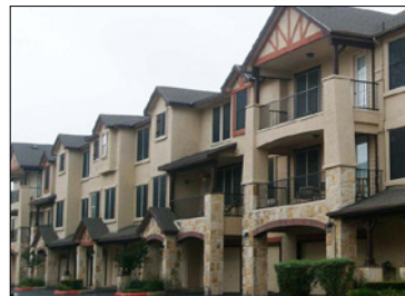
The Landing at Round Rock

City: Round Rock, Texas Buyer: LivCor Purchase Price: $93 MM Price per Unit: $159,634