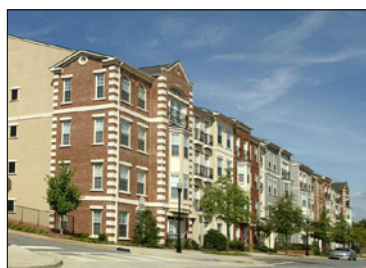
Lakeside at Milton Park

City: Alpharetta, Ga. Buyer: Olen Properties Purchase Price: $98 MM Price per Unit: $213,124