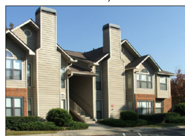
Overlook at Berkeley Lake

City: Duluth, Ga. Buyer: Investcorp Purchase Price: $94 MM Price per Unit: $142,803