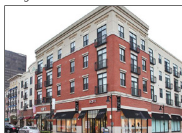
Allegro at the Boulevard

City: St. Louis Buyer: Edwards Realty Co. Purchase Price: $58 MM Price per Unit: $783,783