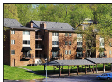
Haven on the Lake

City: Maryland Heights, Mo. Buyer: FPA Multifamily Purchase Price: $48 MM Price per Unit: $90,340