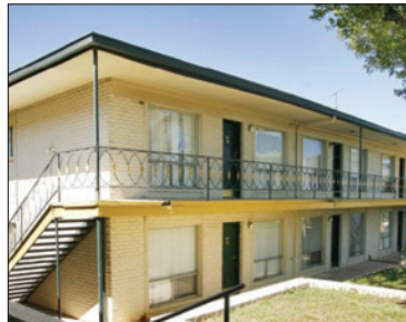
The M on Mulberry