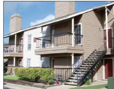
The Place at Oak Hills

City: San Antonio, Texas Buyer: MC Cos. Purchase Price: $24 MM Price per Unit: $69,260