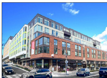
Venn at Main

City: Bellevue, Wash. Buyer: Equity Residential Purchase Price: $177 MM Price per Unit: $504,285