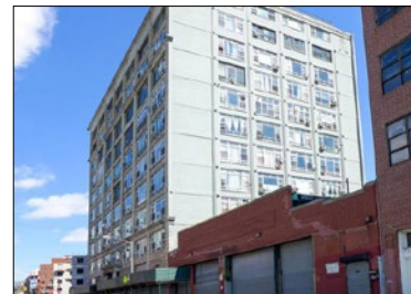
475 Kent Avenue

City: Brooklyn Buyer: Copperline Partners Purchase Price: $56 MM Price per Unit: $540,534