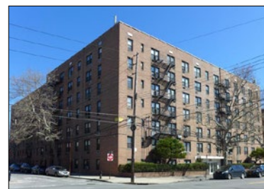
1245 Avenue X

City: Brooklyn Buyer: Dov Management Purchase Price: $37 MM Price per Unit: $596,774