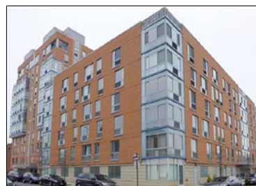
1125 Banner Avenue

City: Brooklyn Buyer: Abro Management Purchase Price: $47 MM Price per Unit: $459,804