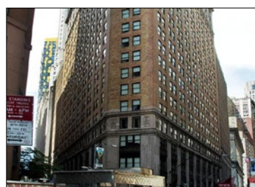
67 Wall Street

City: New York Buyer: Rockpoint Group Purchase Price: $182 MM Price per Unit: $551,032