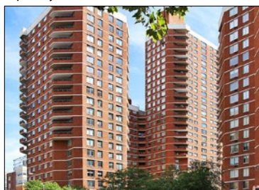
Kips Bay Court

City: New York Buyer: Blackstone Group Purchase Price: $620 MM Price per Unit: $695,512